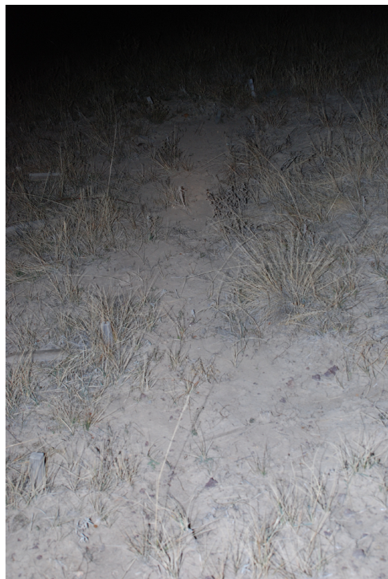
Figure 1: Testing area prior to reagent application. ▶

After removing the topsoil luminol was applied again and a larger area of reaction was observed (Fig. 3). Some “streaking” was observed with the reaction area which was determined to be caused by the shovel