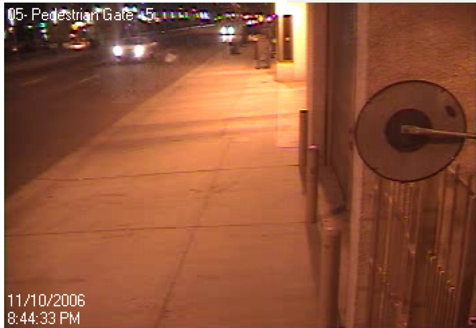
Figure 1 (top) and Figure 2 (bottom)

two different cameras (focused in relatively the same area) investigators realized results that were within 1 mile per hour of each other. This analysis was completed at different locations along the truck's path with similar results. The video showed that the driver applied his brakes and also accelerated at different locations along his route.