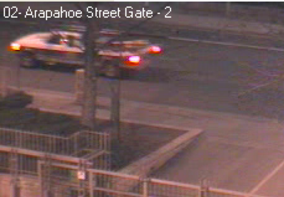
▲ Figure 3 (top) and Figure 4 (bottom)